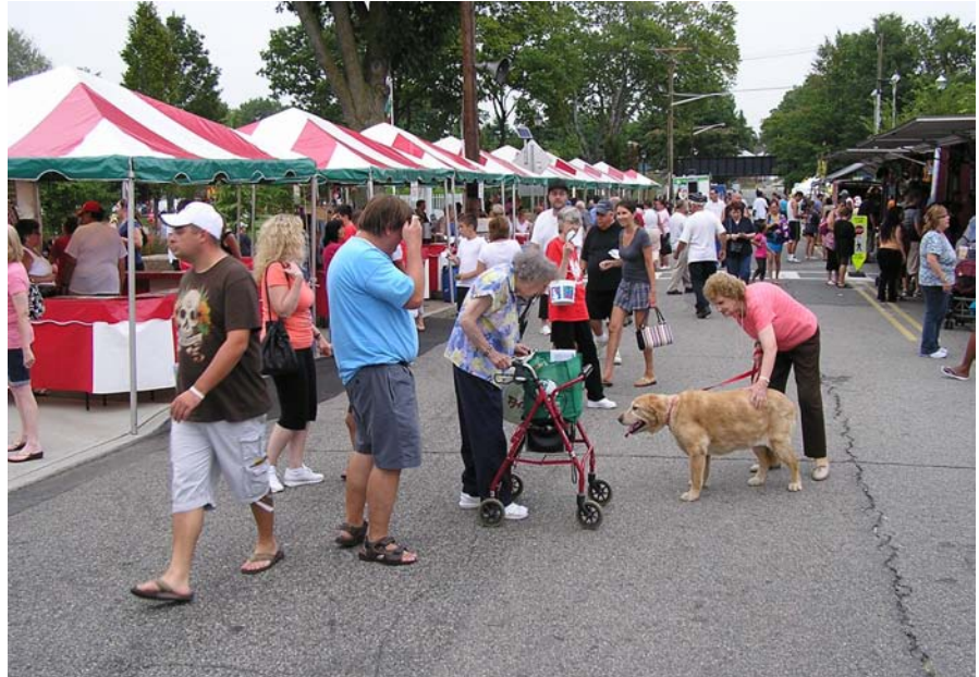
St. Michael's 7th annual Feast Day Celebration at Town Hall Park on Aug. 20-21 was successful in terms of having fun as well as in terms of raising funds for our beautiful parish.