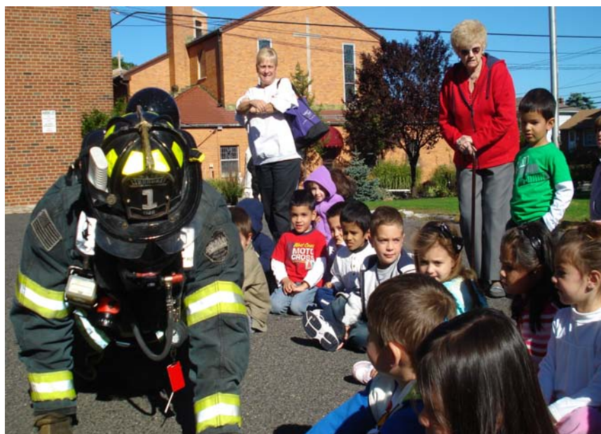
The little angels, our students, of Angel Academy enjoy a demonstration by the Lyndhurst Fire Department during Fire Prevention week last October.

These were men of special character which we can only hope we might see in more people today. We were fortunate to know them we will always remember and miss them. I thank God for the time that we had them with us.