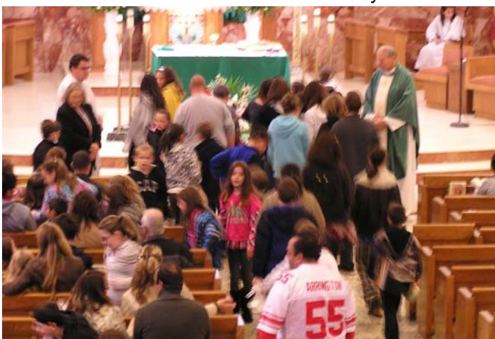
St. Michael's Religious Education students brought up food donations for Thanksgiving baskets during Mass on No. 14.

During 2010 the Meadowlands Board of Realtors conducted three food