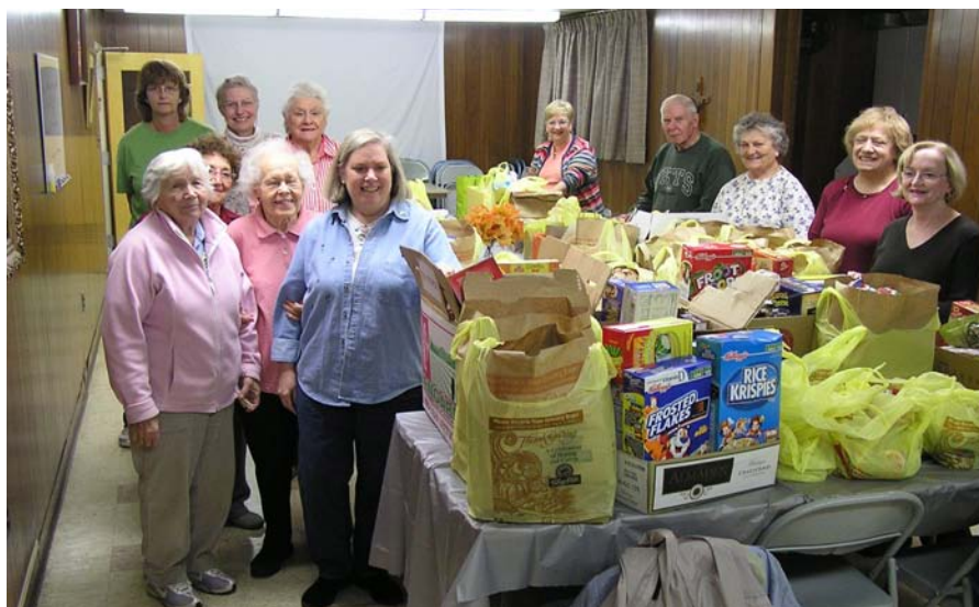
During their Nov. 15 meeting, our Food Pantry volunteers were quite busy sorting and making Thanksgiving baskets from two rooms filled with food donations.